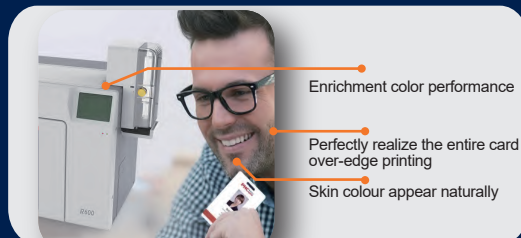
Dye-sublimation transfer printing technology

Alarm for no card, defective card slot Manual feeding card on back end and recycling pending card Available to set the direction of output card