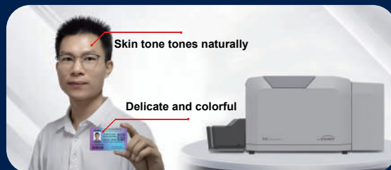
High quality photo processing by Dye sublimation technology

Dual interface card encoding module Contactless ID Card encoding module UHF chip card encoding module Magnetic stripe card encoding module