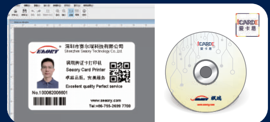
Come with professional printing software