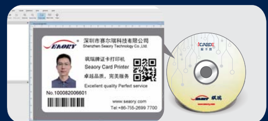
Professional printing software come with the printer