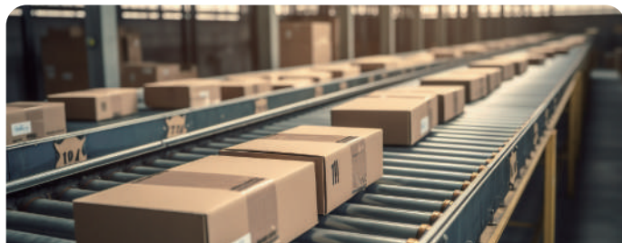
Logistics | Eco-friendly bags/warehousing/points