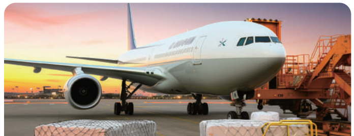
Public Utilities | Aviation/Medical/Finance/Electricity