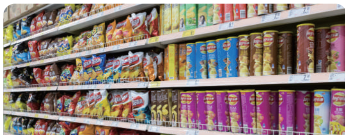
Retail | RetailStore Management/Warehouse Management